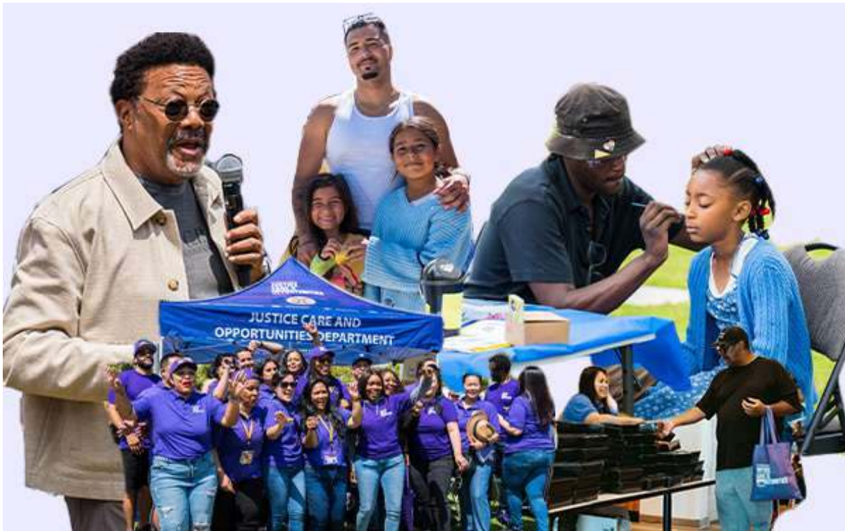
Judge Greg Mathis speaks at JCOD's Father's Day CARE Event