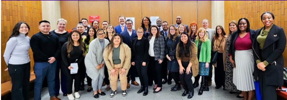
Rapid Diversion Program Partners and Staff