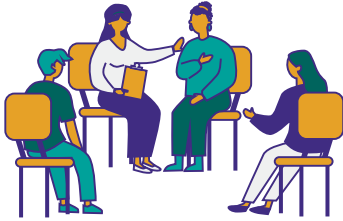
Group sessions that enable comradery and support amongst participants

The Los Angeles County Justice Care and Opportunities Department has implemented a Credible Messenger Program, YO! (Youth Overcoming), that uses a transformative mentorship curriculum for Transitional Age Youths between the ages of 18-26. The services consist of the following six components: