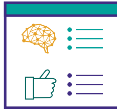
A curriculum based on cognitive behavioral principles