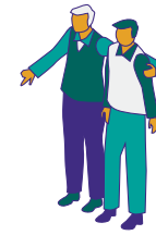
Case managers with lived experience of incarceration who are available for support, advice, and guidance