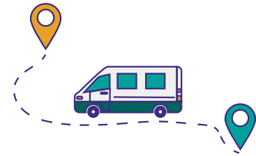
Transportation from and to court appointments