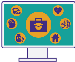
Case management and service navigation